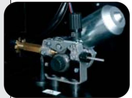
large (Ø37 mm) drive roll